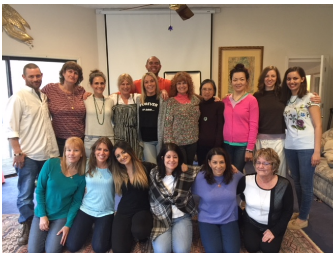
In-Depth Channeling February 10-17, 2018