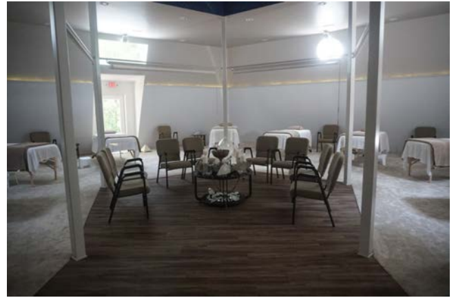
↑ Main Chamber of the Temple of Healing ↓

Healers, and to all of our Delphi Family who give of themselves selflessly in service to the Light.