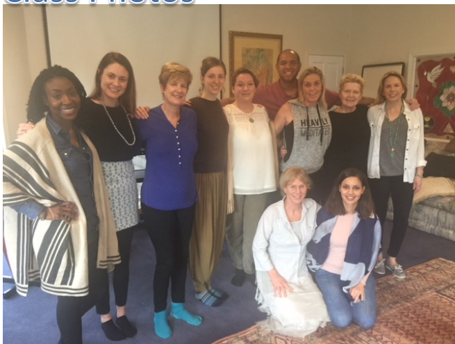
Advanced Channeling - February 17-21, 2018