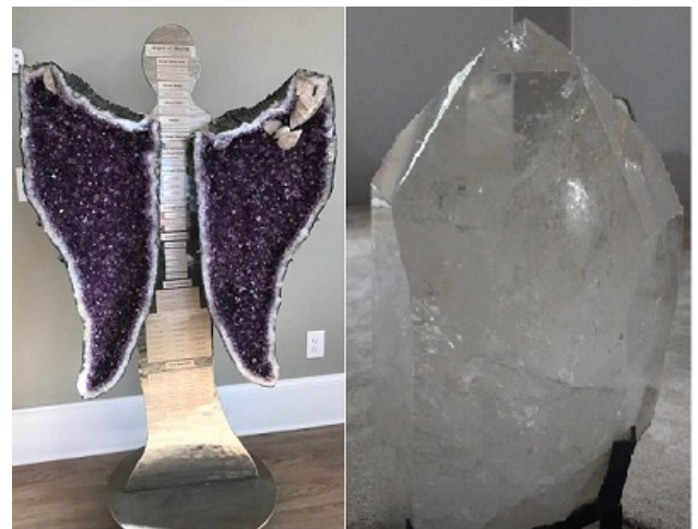
The Angels of Healing Giant Quartz Crystal